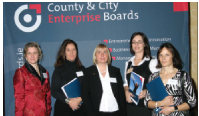
Wicklow delegates at National Women's Enterprise Day 2007