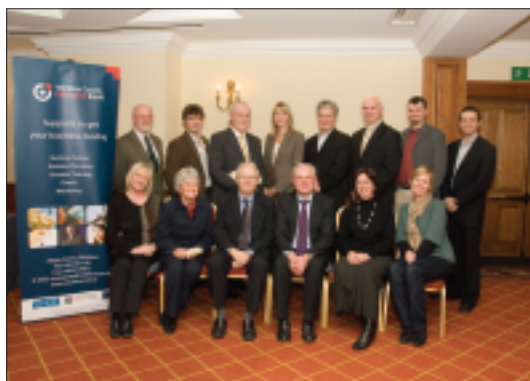
Presentation of KESP Certificates at Glenview Hotel

Last December, over 30 entrepreneurs gathered at the Glenview Hotel to receive their certificates from Wicklow County Enterprise Board for accredited training courses completed in 2007.