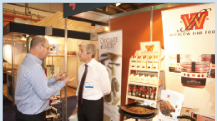
Wicklow Fine Foods at SHOP 2007