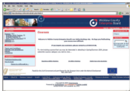
Wicklow CEB's new Online Shop

The booking system is setup on a secure server which accepts payments from Laser and Credit Cards. Places can still be reserved by cheque, allowing 5 days for the cheque to arrive with us. For our ever popular free business seminars it is also a very easy way to secure your place. Log on to www.wicklowceb.ie/training for further information.